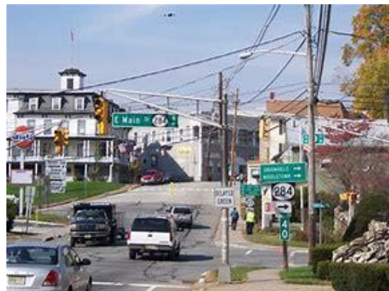
Figure 5 Photo of Main Street from the West

The heart of the neighborhood is the idyllic Main Street. As shown in Figure 1 above, this area has long been a hub of activity. In recent years, Main Street has been the subject to disinvestment, leaving several vacant storefronts amid a few restaurants, shops, and galleries. Norwescap’s facility is at 37 Main, providing housing for seniors and recently renovated space for the Sussex Community & Cultural Center. Main Street is ripe for revitalization resulting in more economic activity and more visitors in the coming years.