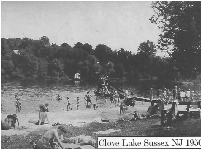
Figure 2 Picture of Clove Lake, circa 1950

In 1926, the Clove Brook was dammed, and Clove Lake was created. It served as a residential and recreational community attracting seasonal tourists offering swimming, boating, and fishing. In 1939, the town offered 13 tourist homes, 5 hotels and 8 restaurants. In the 1950’s, the railroad stopped running, and the town began a long, slow decline. In 1980, the police department was disbanded due to corruption, and Clove Lake was closed due to the high cost of maintenance. Sussex Borough experienced an influx of low-income individuals who -- due to the lack of public transportation, limited employment opportunities, lack of public transportation and few services -- became entrenched in the local community. The local