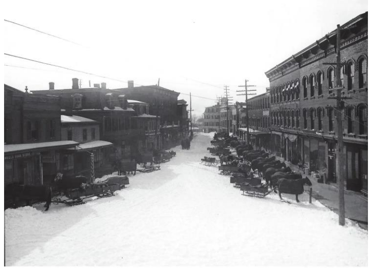
Figure 1 Sussex Borough Main Street, Circa 1905

Sussex Borough was originally settled in 1742 by Peter Decker. The town was incorporated in 1891 as “Deckertown” before changing its name to the current form in 1902. Sussex Borough was a bustling community in the late 1800’s and early 1900’s when it served as the epicenter of Sussex County. The town provided a vast array of businesses such as meat markets, department stores, bakeries, shoemakers, jewelers, a bowling alley, dental parlors, an academy, lumber and coal yards, factories, creameries, restaurants, and a theater. On weekends, the streets were crowded with families with live music during the summer. Two railroad stations made the area an important commercial center, “a boom town” with new families moving in weekly.