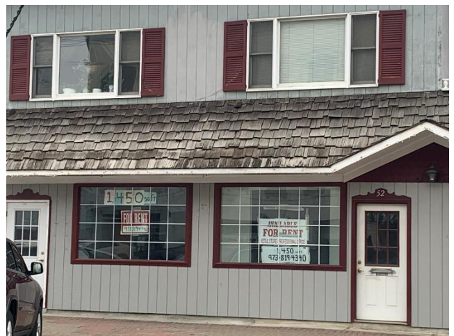
Figure 7 Closed Business in the Neighborhood

In the Borough, housing stock is generally older with 37.1% of units build before 1939 and 73.6% before 1970. Fifteen percent of the homeowners owned their homes before 1990, and 60.0% have moved in since 2010, with more than one-third (34.8%) having moved in since 2015. Among the homes in the town, 1.9% lack complete plumbing and 4.0% have incomplete kitchen facilities. One in five (21.2%) of owners have mortgage payment the equates to more than 30% of their household income. Renters also struggle to survive in the Borough. The median rent is $1,216 with 52.8% of units falling between $1,000 to $1,499. Two-thirds (64.8%) of renters pay more than 30 percent of their income for rent. The economic environment in the neighborhood is also lacking. Vacant storefronts dot Main Street contributing to Sussex County's high business vacancy rate of 11.7 (compared to New Jersey rate of 6.4). The local hospital in the Borough was closed in 2012 resulting in lost jobs and an abandoned facility for which a new use has not been determined. The dwindling tax base has