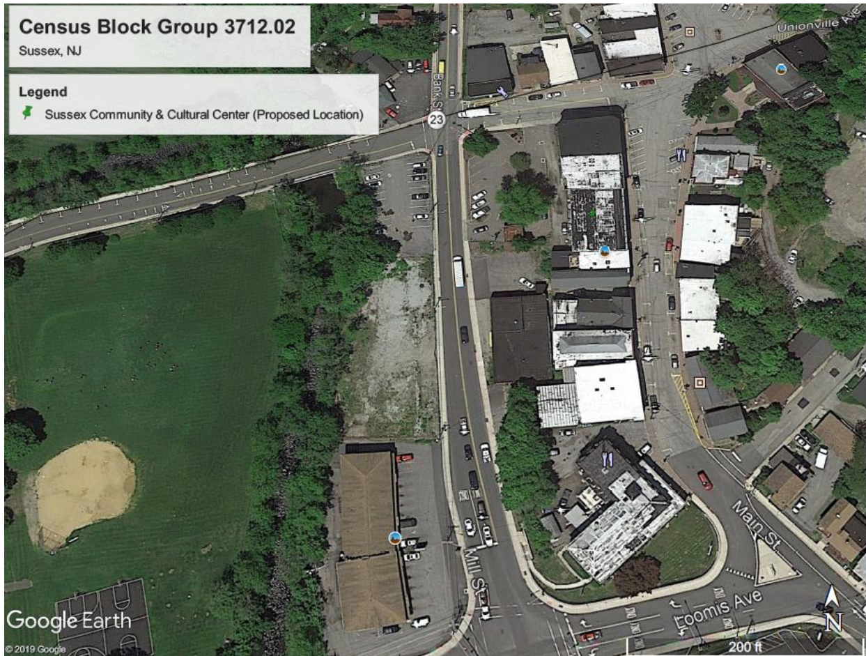
Figure 4 Map of Main Street Area

The heart of the neighborhood is the idyllic Main Street. As shown in Figure 1 above, this area has long been a hub of activity. In recent years, Main Street has been the subject to disinvestment, leaving several vacant storefronts amid a few restaurants, shops, and galleries. Norwescap’s facility is at 37 Main, providing housing for seniors and recently renovated space for the Sussex Community & Cultural Center. Main Street is ripe for revitalization resulting in more economic activity and more visitors in the coming years.