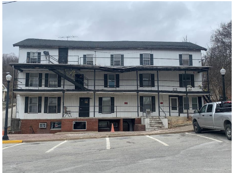
Figure 6 Multi-Unit Housing Facility in Sussex Borough

The neighborhood is home to 681 housing units of which 77% are occupied giving a non-seasonal vacancy rate of 23%. Approximately three-fourths of homes are renter-occupied (73%) with other 27% occupied by homeowners. The median value of owner-occupied units is $173,400, significantly lower than the rate for Sussex County ($267,500). The plurality of housing units in the Borough are 1-unit detached (37.2%), with 26.4% of units containing ten or more living spaces. Seventy-two percent of the structures are multi-unit facilities. Large historic homes have been sectioned into multiple apartments with out-of-state landlords creating a large influx of temporary low-income residents. The Borough's largest multi-unit rental facility was closed in 2019 due to its dilapidated condition.