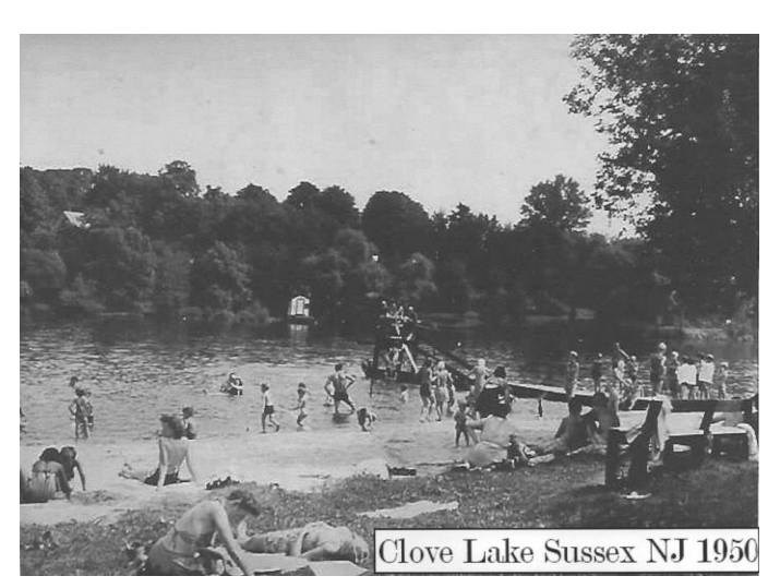
Figure 2 Picture of Clove Lake, circa 1950

the summer. Two railroad stations made the area an important commercial center, "a boom town" with new families moving in weekly.