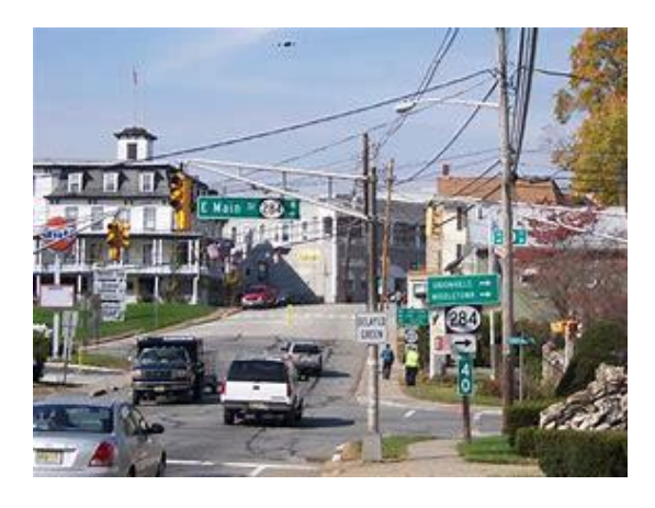
Figure 5 Photo of Main Street from the West

The heart of the neighborhood is the idyllic Main Street. As shown in Figure 1 above, this area has long been a hub of activity. In recent years, Main Street has been the subject to disinvestment, leaving several vacant storefronts amid a few restaurants, shops, and galleries. Norwescap's facility is at 37 Main, providing housing for seniors and recently renovated space for the Sussex Community & Cultural Center. Main Street is ripe for revitalization resulting in more economic activity and more visitors in the coming years.