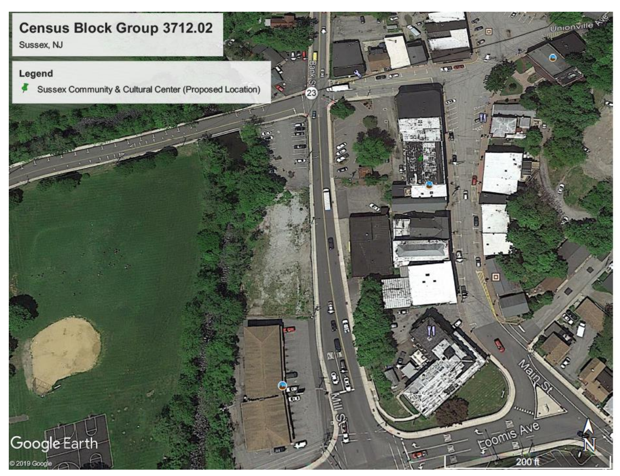
Figure 4 Map of Main Street Area

The heart of the neighborhood is the idyllic Main Street. As shown in Figure 1 above, this area has long been a hub of activity. In recent years, Main Street has been the subject to disinvestment, leaving several vacant storefronts amid a few restaurants, shops, and galleries. Norwescap's facility is at 37 Main, providing housing for seniors and recently renovated space for the Sussex Community & Cultural Center. Main Street is ripe for revitalization resulting in more economic activity and more visitors in the coming years.