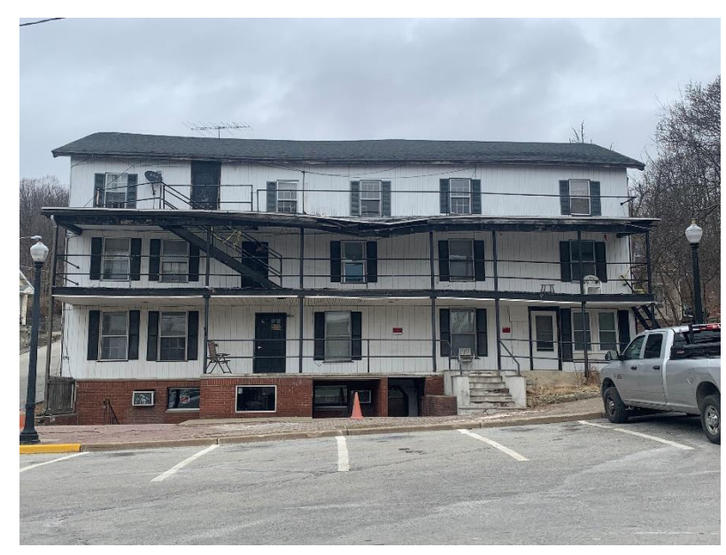
Figure 6 Multi-Unit Housing Facility in Sussex Borough

The neighborhood is home to 681 housing units of which 77% are occupied giving a non-seasonal vacancy rate of 23%. Approximately three-fourths of homes are renteroccupied (73%) with other 27% occupied by homeowners. The median value of owner-occupied units is $173,400, significantly lower than the rate for Sussex County ($267,500). The plurality of housing units in the Borough are 1-unit detached (37.2%), with 26.4% of units containing ten or more living spaces. Seventy-two percent of the structures are multi-unit facilities. Large historic homes have been sectioned into