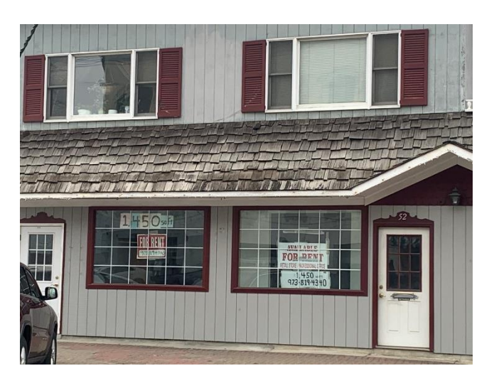
Figure 7 Closed Business in the Neighborhood

incomplete kitchen facilities. One in five (21.2%) of owners have mortgage payment the equates to more than 30% of their household income. Renters also struggle to survive in the Borough. The median rent is $1,216 with 52.8% of units falling between $1,000 to $1,499. Two-thirds (64.8%) of renters pay more than 30 percent of their income for rent. The economic environment in the neighborhood is also lacking. Vacant storefronts dot Main Street contributing to Sussex County's high business vacancy rate of 11.7 (compared to New Jersey rate of 6.4). The local hospital in the Borough was closed in 2012 resulting in lost jobs and an abandoned facility for which a new use has not been determined. The dwindling tax base has