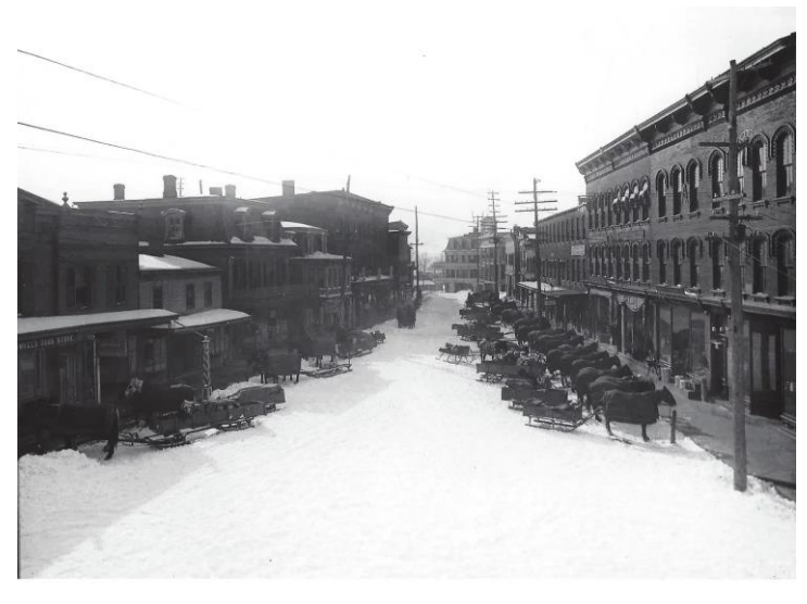
Figure 1 Sussex Borough Main Street, Circa 1905

Sussex Borough was originally settled in 1742 by Peter Decker. The town was incorporated in 1891 as "Deckertown" before changing its name to the current form in 1902. Sussex Borough was a bustling community in the late 1800's and early 1900's when it served as the epicenter of Sussex County. The town provided a vast array of businesses such as meat markets, department stores, bakeries, shoemakers, jewelers, a bowling alley, dental parlors, an academy, lumber and coal yards, factories, creameries, restaurants, and a theater. On weekends, the streets were crowded with families with live music during